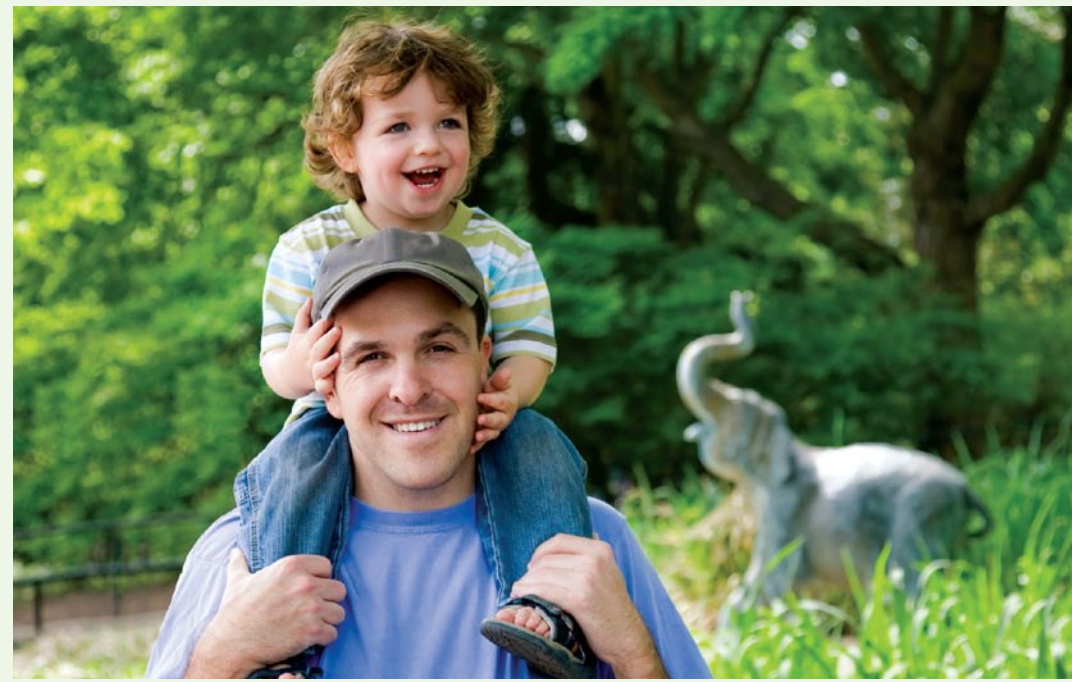
Medical • Dental • Vision • Supplemental term life insurance